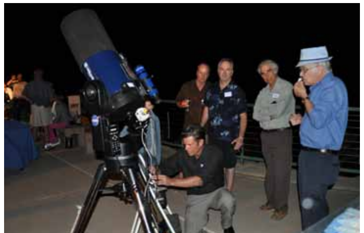
Stargazing with the S.D. Association of Astronomers